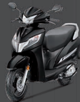
PEARL NIGHT STAR BLACK