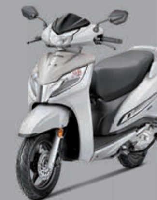
PEARL PRECIOUS WHITE WITH SALEN SILVER METALLIC