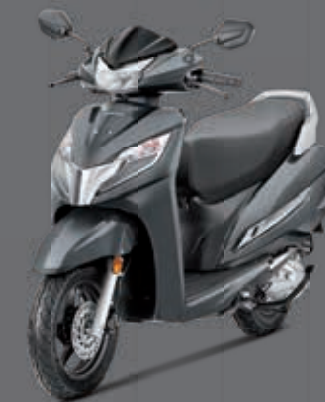
HEAVY GRAY METALLIC