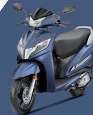
MIDNIGHT BLUE METALLIC